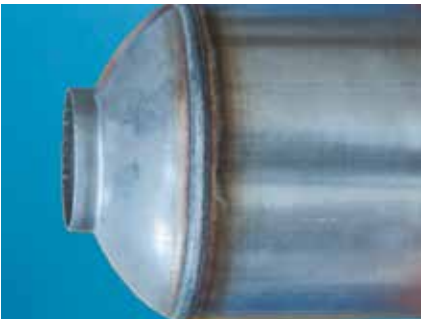
Exhaust system in ferritic stainless steel