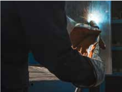
All position welding