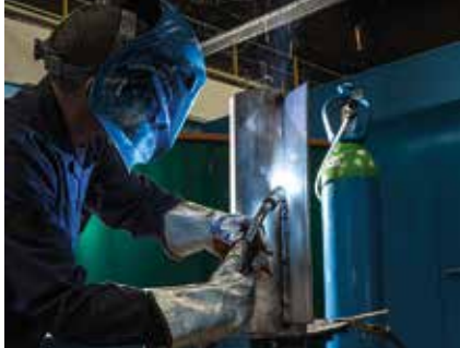
MAG welding of stainless steel

The high-performance gas shielding solution for all stainless steel MAG applications