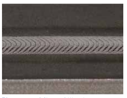
Plasma welding of titanium

ARCAL ^{\text{TM}} Prime is available with the best supply modes ensuring quality, consistency and ease of use