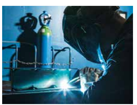
MIG welding of aluminium