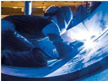
TIG welding of stainless steel