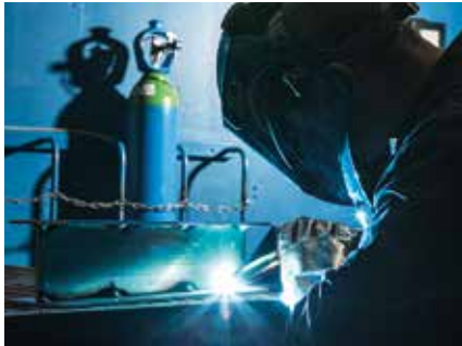
MIG welding of aluminium

The high-performance gas shielding solution for TIG and MIG welding of all materials