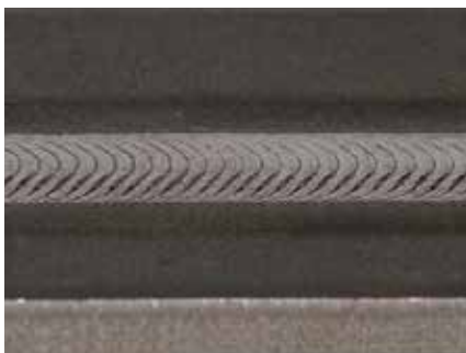
Plasma welding of titanium